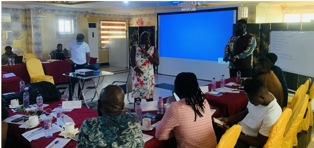
WAAF EpiC Team and volunteers seated in the training

Between the 21st – 25th of November 2022, the WAAF EpiC team together with the FHI 360 EpiC Ghana team conducted two refresher trainings for EpiC project staff. One was a 3- day training for Peer Educators and mobilisers and another, a 2-day training for PrEP champions and Lay Counsellors. These activities were necessitated as a requirement for implementation of the just begun EpiC phase III. These training courses were to refresh the knowledge of key players in the implementation process and update them on the goals of the project and their specific roles and strategies to successfully complete the EpiC project. The training also addressed the bottlenecks encountered in the previous years of implementation in Phase I and II. The activities also presented a great opportunity to share updates on recent changes made to the HIVST and PrEP implementation guidelines. This was a brilliant opportunity to prepare the team as they started to work on the project.