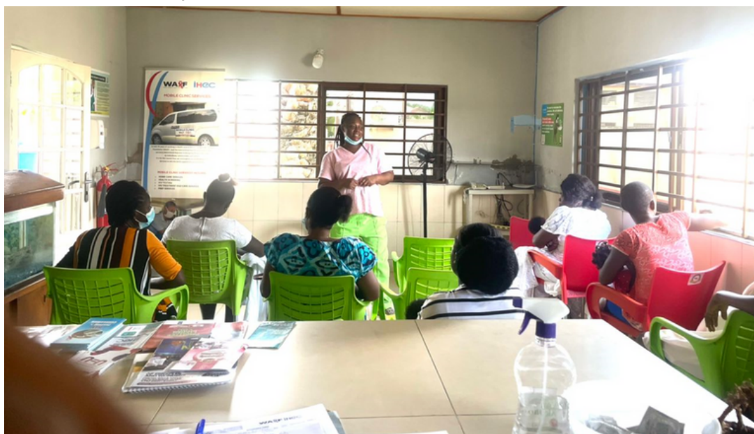
Clients seated in the HM=HB Session

The Healthy Mother Equals Healthy Baby (HM=HB) project has been ongoing for over a decade with support from the GladStar ministry in the USA. This program has educated and supported pregnant and lactating women living with HIV who receive care at the International Health Care Centre (IHCC). In November 2022, the STAR Ghana matching fund joined the Gladstar ministry to collaboratively fund this project. This has enabled us to increase coverage of beneficiaries.